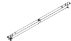
3 - Beam