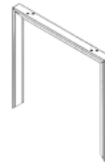
1 - Side Leg