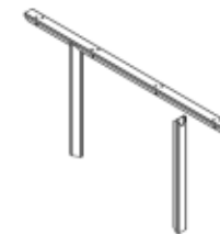
2 - Middle Leg