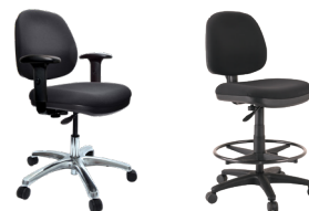
ALI BASE With Arms