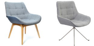
4 LEG WOOD BASE Custom upholstery with buttons 4 STAR SWIVEL BASE Custom