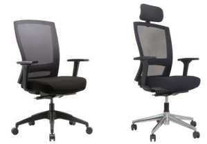
NYLON BASE Arms