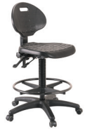
ARCHITECTURAL GAS LIFT with Black P/C Foot Ring