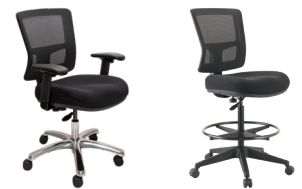
ALI BASE With Arms

212-153-ARCH Metro II Connect Architectural